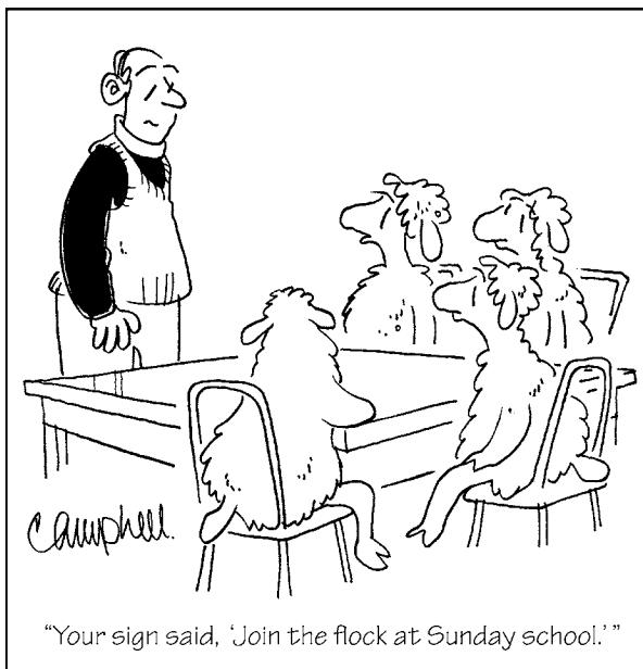
"Your sign said, 'Join the flock at Sunday school.'"