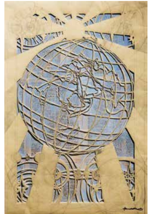
(Image: to be a blessing, by Hannah Garrity, Inspired by Genesis 12:1-4a, Paper lace and pencil over oil paint on paper © 2023 A Sanctified Art)

Like the characters in our Lenten scriptures, we are also seeking many things: clarity, connection, wonder, justice, balance. We are seeking our calling, the sacred, and how to live as a disciple. Throughout the turbu-