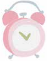
Sunday School Open House @ 9 am