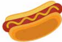
Enjoy Lunch after church