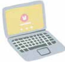
Register for Faith Formation Programs