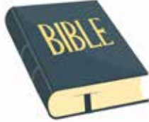
Learn about the Bible and your faith