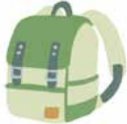
Blessing of the Backpacks during Worship at 10:30 am