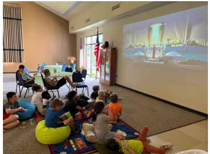
First Congo Kids Playdate and Movie • August 18 (another photo on p. 7)